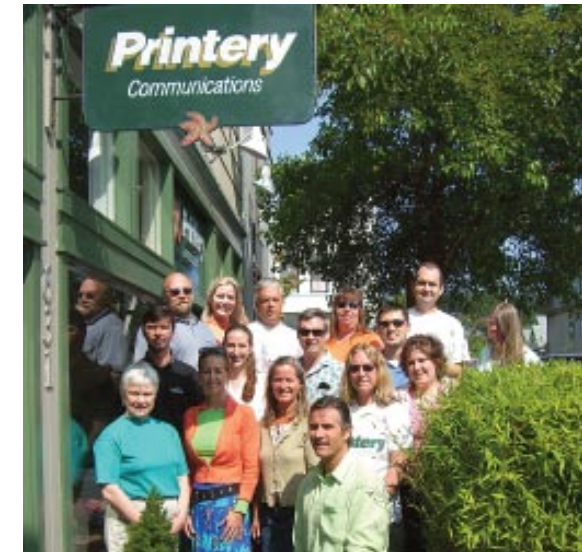
All-Star staff at Printery in Port Townsend

To view the additional honors they have earned or for more information on Printery Communications and Star Copy Center visit www.printery.com . 631 Tyler Street Port Townsend, WA 98368 360-385-1256