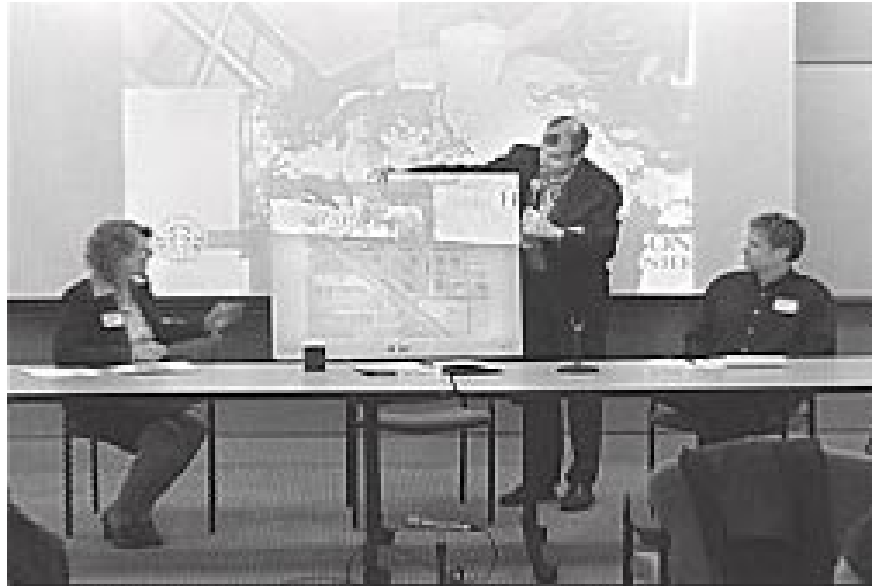
The team from Fred Hutchinson Cancer Research Center shared insights about their successful green practices with other EnviroStar business leaders.